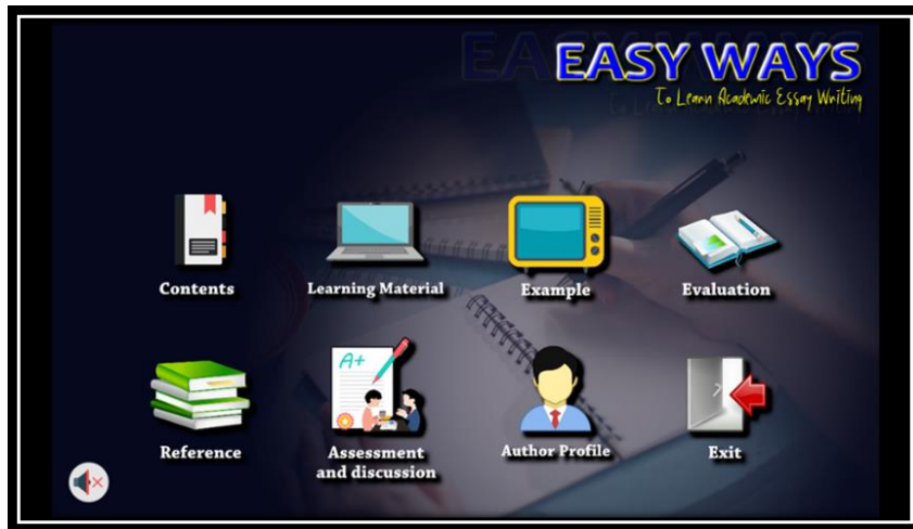
Figure 1. The Menu Background of Instructional Material Using Adobe Animate

technology help them to make it easier even though lecturer can used another multimedia tools to teach academic essay writing Adobe Animate still one of the best tools in multimedia technology in teaching academic essay writing.