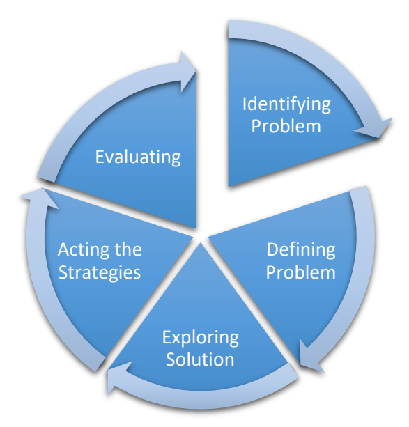
Chart 1. Procedural Steps in Problem Solving

Experts have been studying the procedural phases of problem-solving. According to Kirkley (2003), the general steps in conducting the problem-solving skill areas are as presented in the following figure.