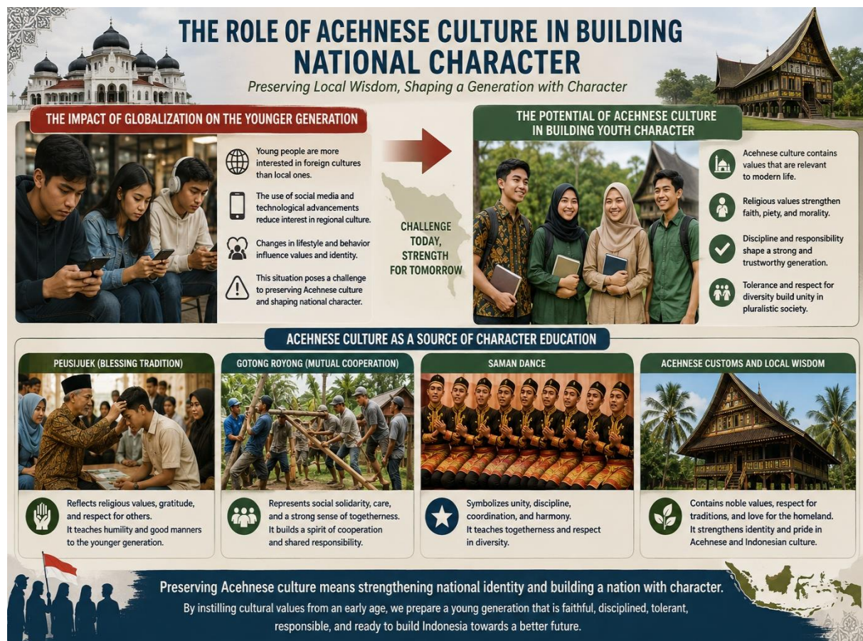
Figure: 3. The Role of Acehese Culture

This infographic illustrates the dual impact of globalization and local cultural preservation on the character development of the younger generation in Indonesia. It highlights how globalization, social media, and technological advancements have influenced young people's lifestyles, leading to a growing preference for foreign cultures and a declining interest in local traditions (Fatmi & Fauzan, 2022). These changes pose significant challenges to preserving Acehese cultural heritage and strengthening national identity. At the same time, the infographic emphasizes the potential of Acehese culture as a powerful source of character education. Cultural traditions such as Peusijuek (blessing ceremony), Gotong Royong (mutual cooperation), and the Saman Dance embody essential values including religiosity, discipline, responsibility, social solidarity, cooperation, tolerance, and respect for diversity (Mardiah et al., 2026). These values remain highly relevant in modern society and can help shape a generation that is morally grounded, socially responsible, and committed to national unity. The infographic concludes that preserving Acehese culture is not only important for maintaining local identity but also for strengthening national character. By integrating cultural values into education and daily life, Indonesia can cultivate a young generation that is faithful, disciplined, tolerant, responsible, and prepared to contribute positively to the nation's future.