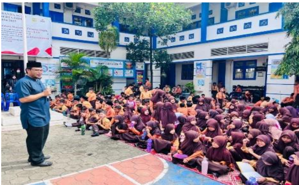
Figure: 2. Character Education Building

The research also found that globalization has a significant impact on changing the behavior of the younger generation. Many students are more interested in foreign cultures than local ones. The use of social media and technological advancements have led to a decline in interest in regional culture. This situation poses a challenge to efforts to preserve Acehese culture and shape national character (Hurriah et al., 2021). Acehese culture still holds great potential for building the character of the younger generation because its cultural values are relevant to modern life, such as religious values, discipline, responsibility, and tolerance (Nasir & Juliandi, 2021).